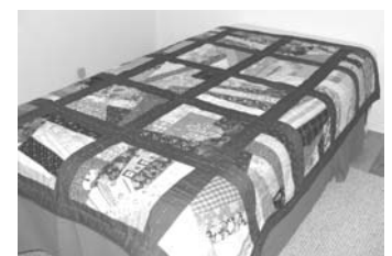
Top and middle left photos: greeting Siemens workers at Saskatoon airport. Middle right, Regina committee members meet Shaunavon's newest Ukrainian family. Above, hand-sewn quilts from Hague and Osler.